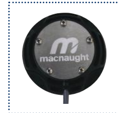
A - Standard Pulse Reel/Hall Effect I - Standard Pulse Reel/Reed Effect J - Standard Pulse Hall/Hall Effect K - High Resolution Hall NPN

The MX25 1" Digital Flow Meters are suitable for flows between 1.6-32 GPM. The 1" Digital Flow Meters have an accuracy of +/- 0.5% and provides exceptional levels of reliability and durability.