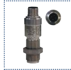
B - Ex approved (Ex ia) Intrinsically Safe - NPN N - Ex approved (Ex ia) Intrinsically Safe - NAMUR T - High Temp. Pulse Max temp- 150°C