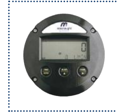
F - ER LCD Display (17mm) G- ERA LCD Display (17mm) H- ERB LCD Display (17mm) Batch controller