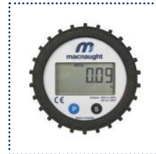
D - PR LCD Display (12mm) E - PRA LCD Display (12mm) with outputs