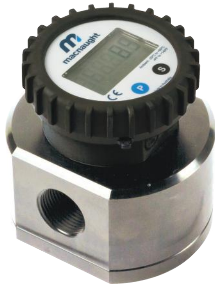
MX25P-1SE Stainless steel body with LCD register