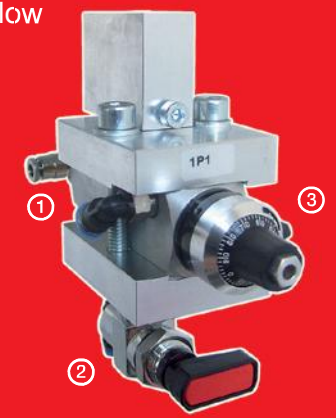
Fig.: Pump module L60