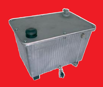
Fig.: Reservoir A27AWNC