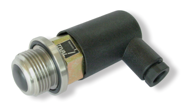
shown with connector plug