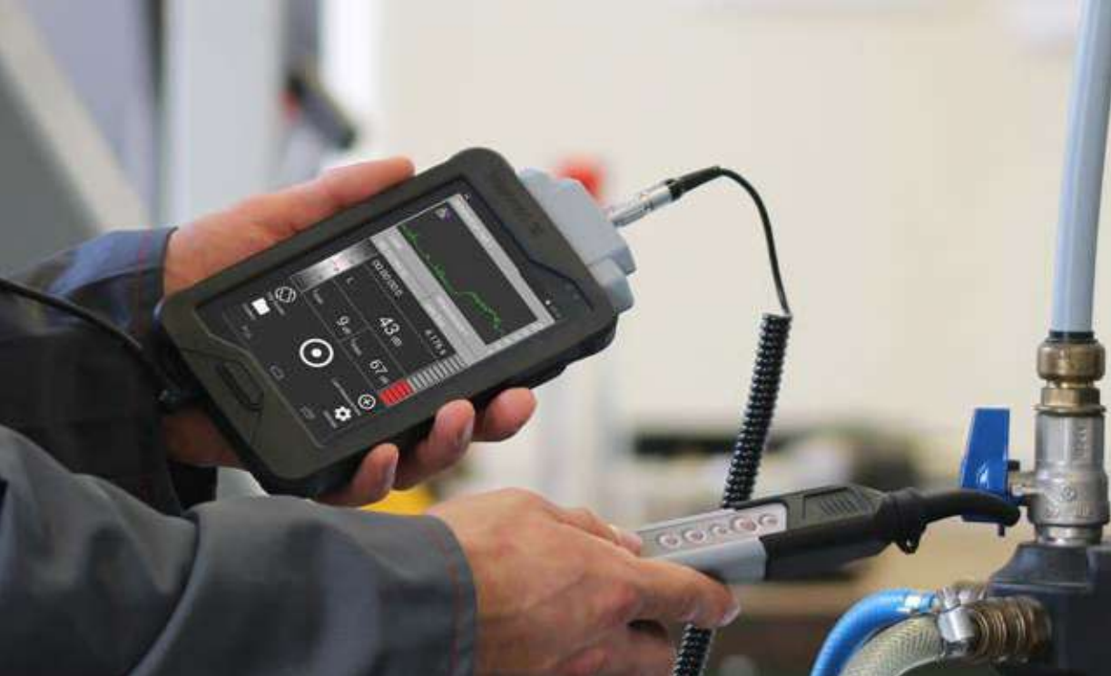
SONAPHONE Digital ultrasonic testing device for maintenance 4.0