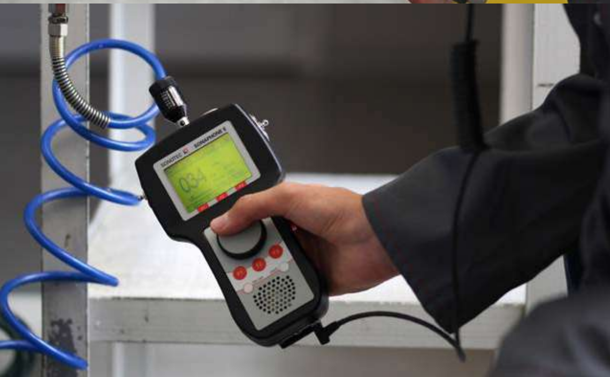
SONAPHONE E ATEX certificated for the use in areas with risk of explosion