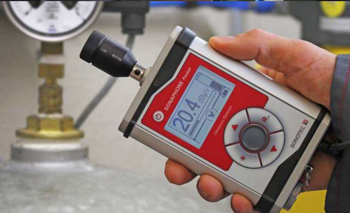
SONAPHONE Pocket The smallest testing device of the SONAPHONE-family