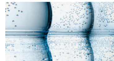
Innovative recirculation system for pumping media containing gas.