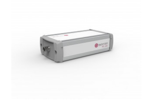
PFL-200 for BNC detectors for fast flicker measurements