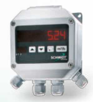
LED display in wall housing